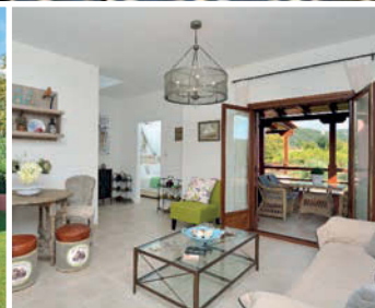
1 Bedroom apartment